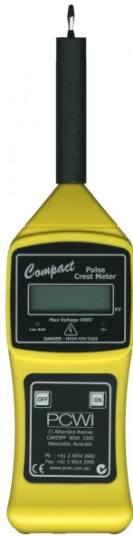
Crest Meter & Certification